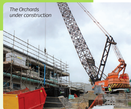
The Orchards under construction

Metlifecare encourages shareholders to opt in to receive electronic communications. This reduces costs, enables faster communication and also provides environmental benefits. To opt in, please complete and return the enclosed form or update your details at: www.investorcentre.com/nz .